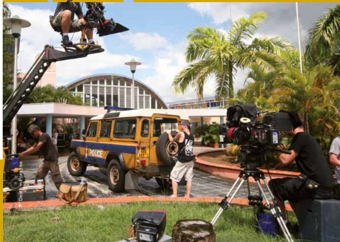
* Death in Paradise