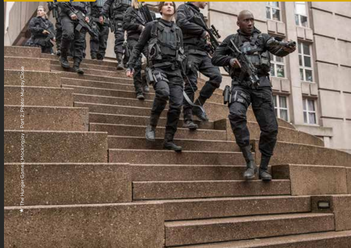
* The Hunger Games: Mockingjay - Part 2, Photo: Murray Close